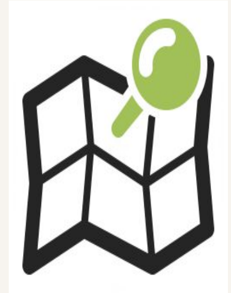
Otter Snacks Map