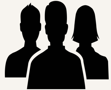
Lack of knowledge