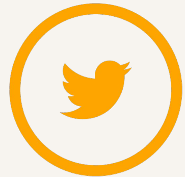
AS No Waste