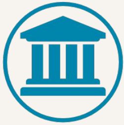
Cost of education

The root causes of food insecurity on our campus are imposed by the barriers due to