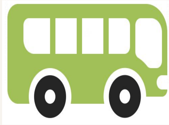
Free Bus System