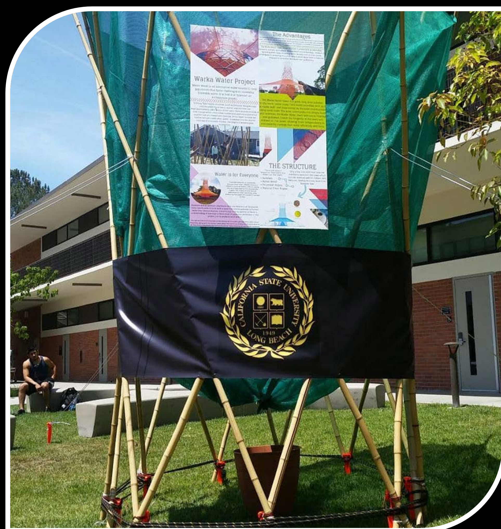
Figure 1. The Proof-of-Concept model located in front of the Global Studies Institute at LA3-100 CSULB.