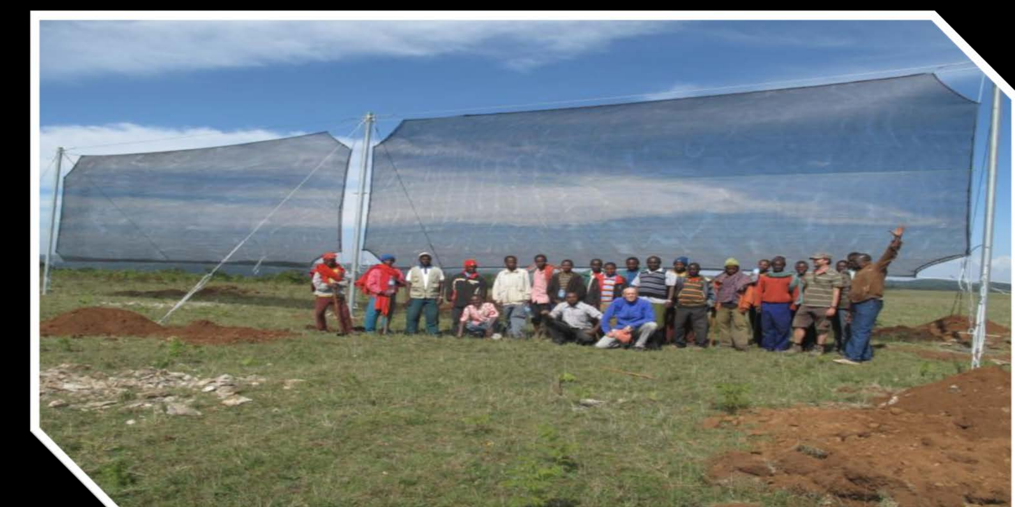
Figure 4. A FogQuest net in Tanzania