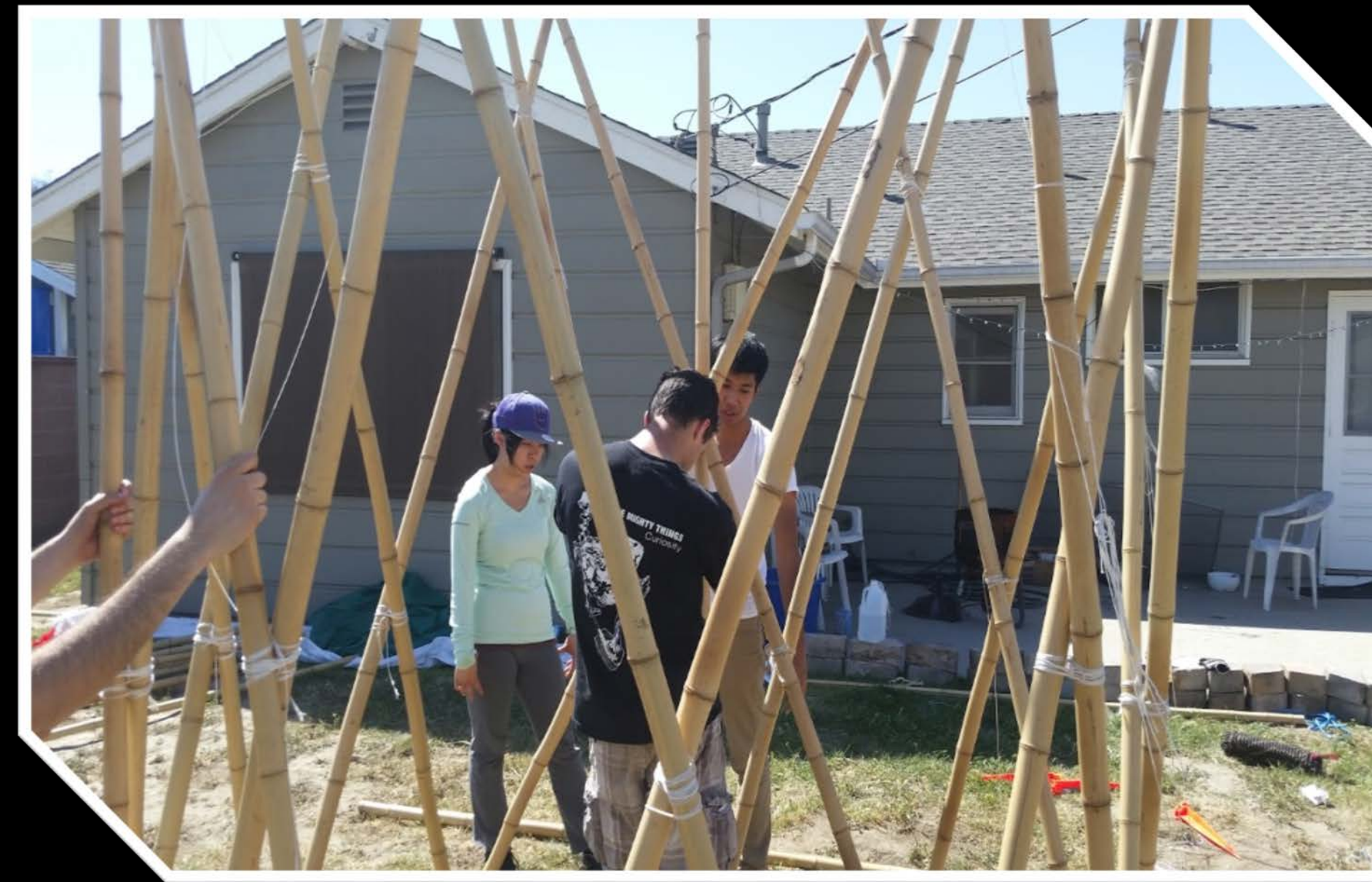
Figure 2. Construction of the proof-of-concept model.