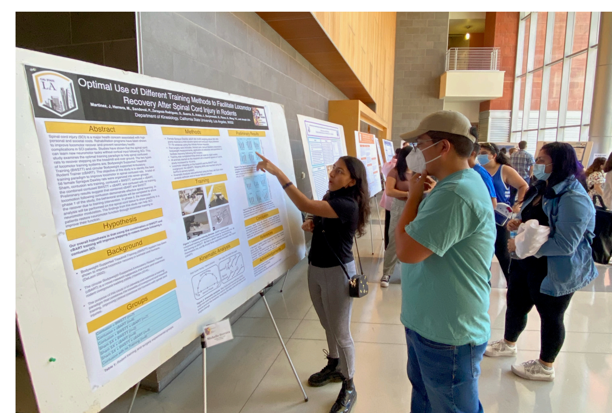
SPROUT program poster session brings together talented students to showcase their research findings.

The REU in Chemistry and Biochemistry program aim is to introduce students to research opportunities in the many fields of chemistry and biochemistry. REU students work along side faculty and students, and attend several workshops throughout the summer that include Dealing with Imposter Syndrome , Critical Reading of the Literature , and Ethics and the Responsible Conduct of Research .