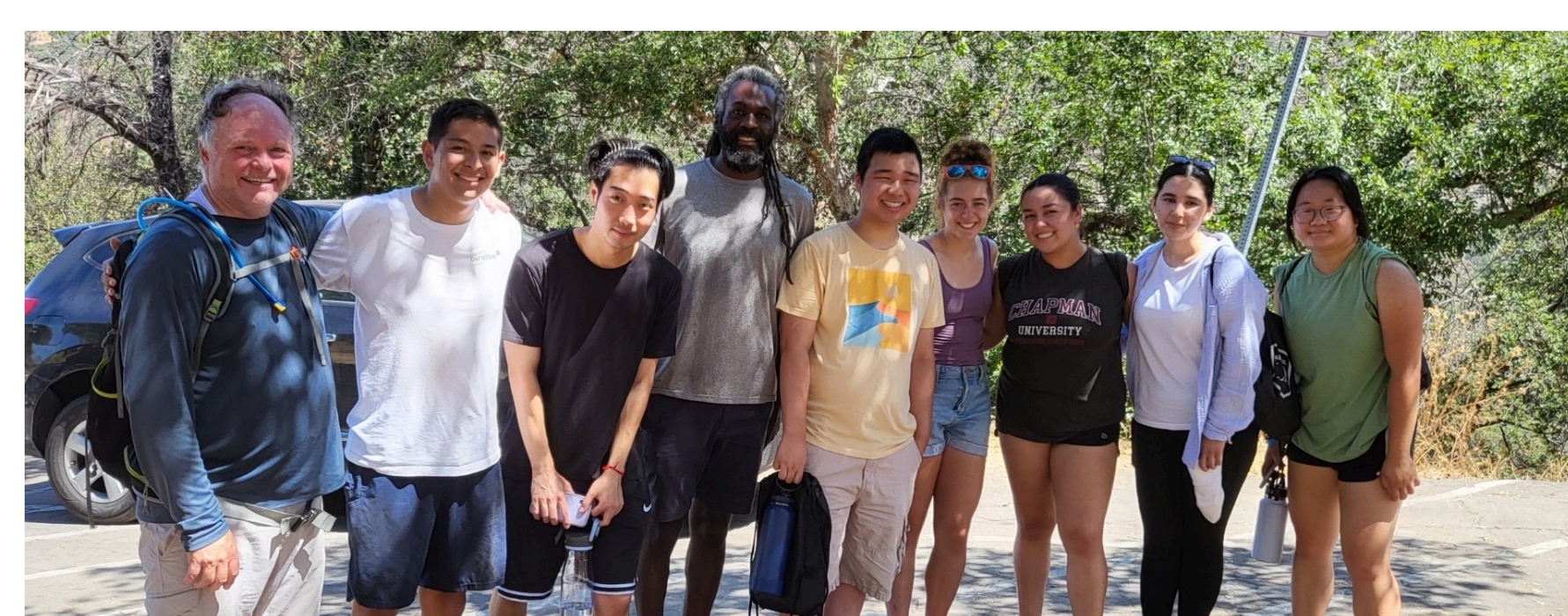
Exploring science and nature together! Chemistry and Biochemistry REU program directors and students take in the stunning views of Altadena, California.

The REU in Chemistry and Biochemistry program aim is to introduce students to research opportunities in the many fields of chemistry and biochemistry. REU students work along side faculty and students, and attend several workshops throughout the summer that include Dealing with Imposter Syndrome , Critical Reading of the Literature , and Ethics and the Responsible Conduct of Research .