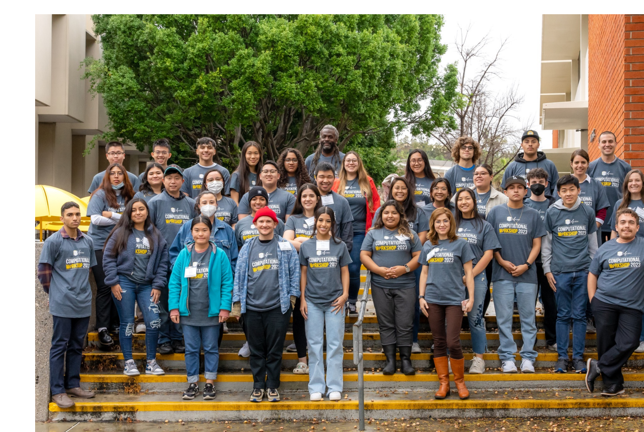
PREC computational workshop students represent the diversity and innovation of the future of computational research.

Cal State LA and the Molecular Software Sciences Institute (MoSSI) at Virginia Tech collaborate to incorporate machine learning techniques in molecular simulation research and develop innovative pedagogical materials to train early-stage undergraduate students in computational science.