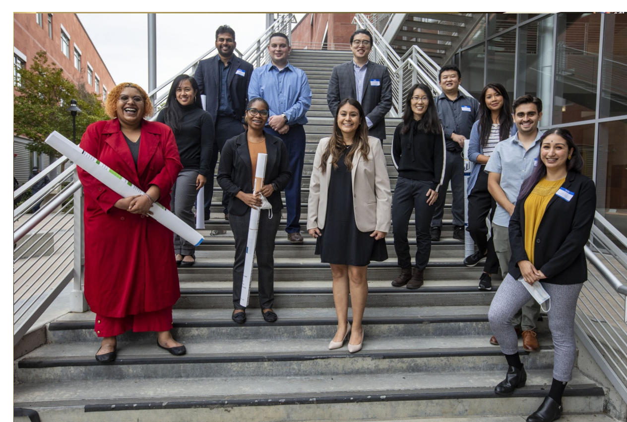
SPROUT program provides students with research experience and opportunities to present their scientific work.

Summer research programs at Cal State LA offer students a unique opportunity to dive into the world of research and innovation. These programs allow students to work closely with faculty mentors, collaborate with peers, and gain practical experience in their field of interest. From civil engineering to computational science, these programs provide students with diverse research opportunities to explore.