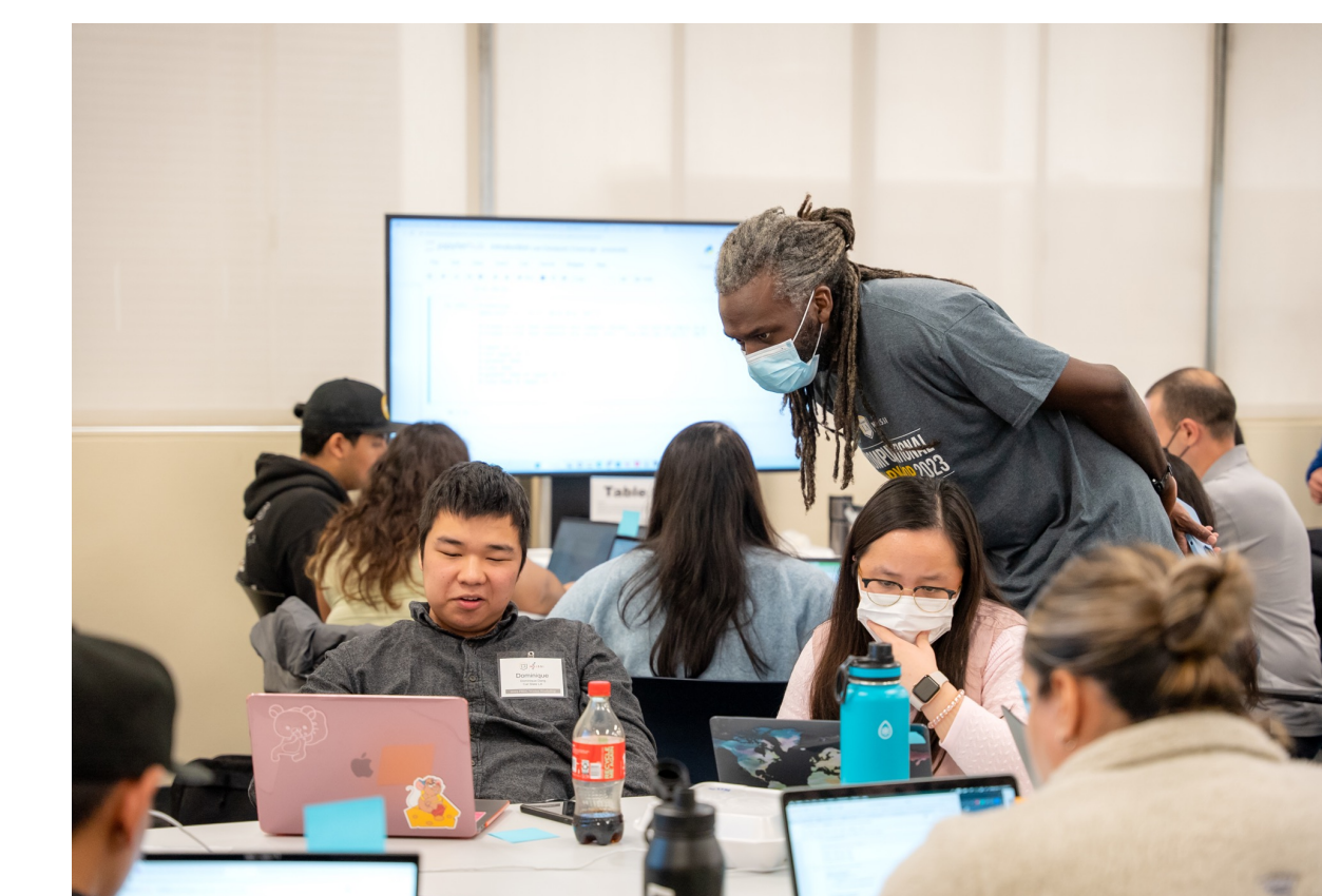
THE PREC program computational workshop teaches students the foundations of molecular science.