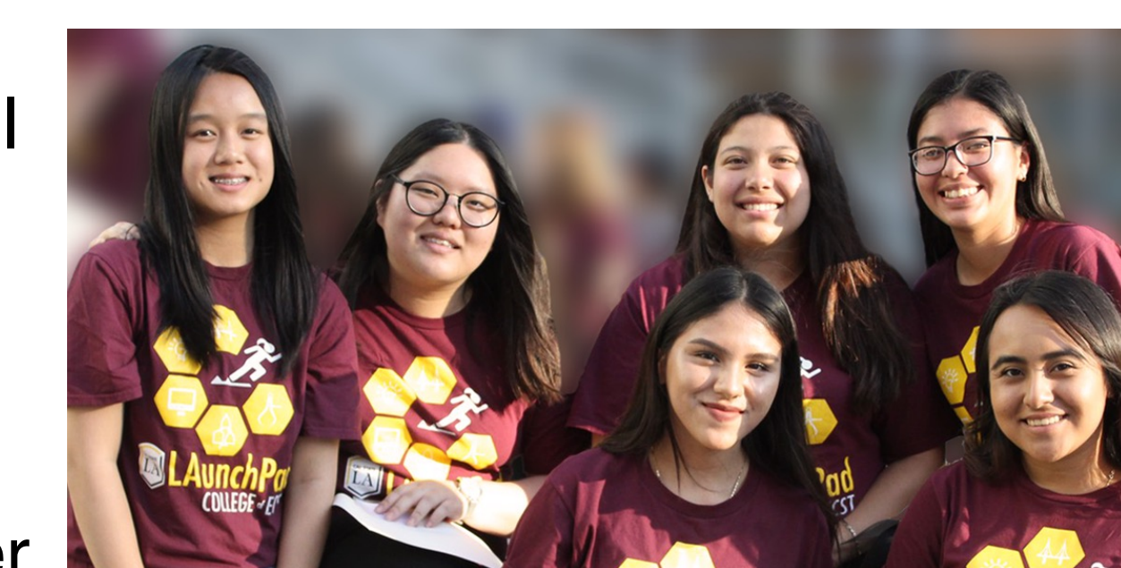
Empowering the next generation of female scientists! High school girls participate in the LAUNCHPAD program.