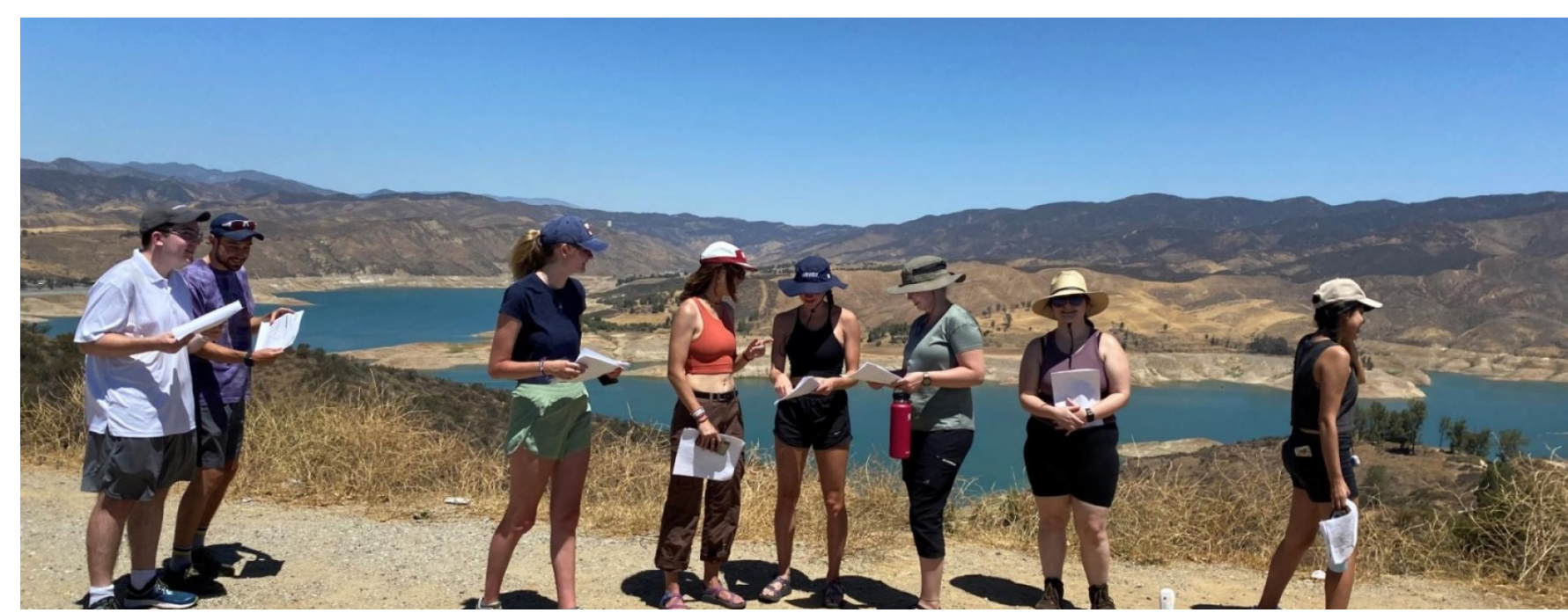
Learning by doing! REU students in the Urban Hydrology program explore the science of water management on a field visit.

The NSF REU: Response of Hydrological Systems in Urban Areas Due to Human Disturbance and Climate Change provide students with a research and cultural experience under the guidance and mentorship in water-related fields, such as hydrogeology, watershed analysis, and hydrologic modeling.