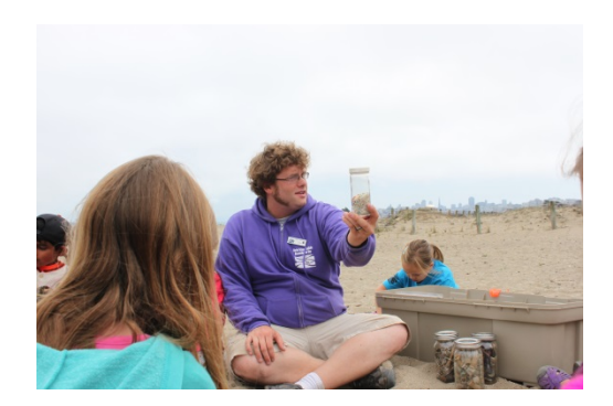
Sanctuary Saturdays – Once a week

Nurdles. It's a funny sounding word that is actually a big problem. These tiny pieces of plastic end up on our beaches and into the stomachs of wildlife. Our Marine Science Explorers are helping with this problem by cleaning them up from our beautiful beaches.