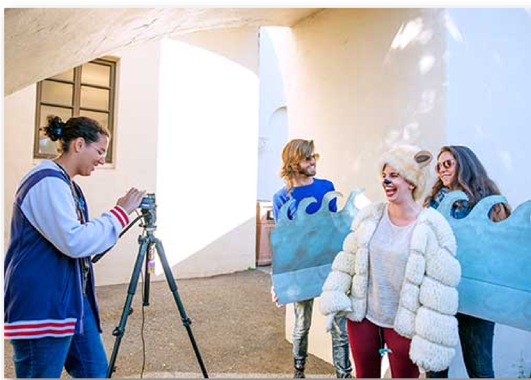
Students in the Interdisciplinary Perspectives on Climate Change course (ENST 480/GEOG 473) team up with Journalism students to film a public service announcement