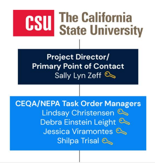
Exhibit B – Organizational Chart