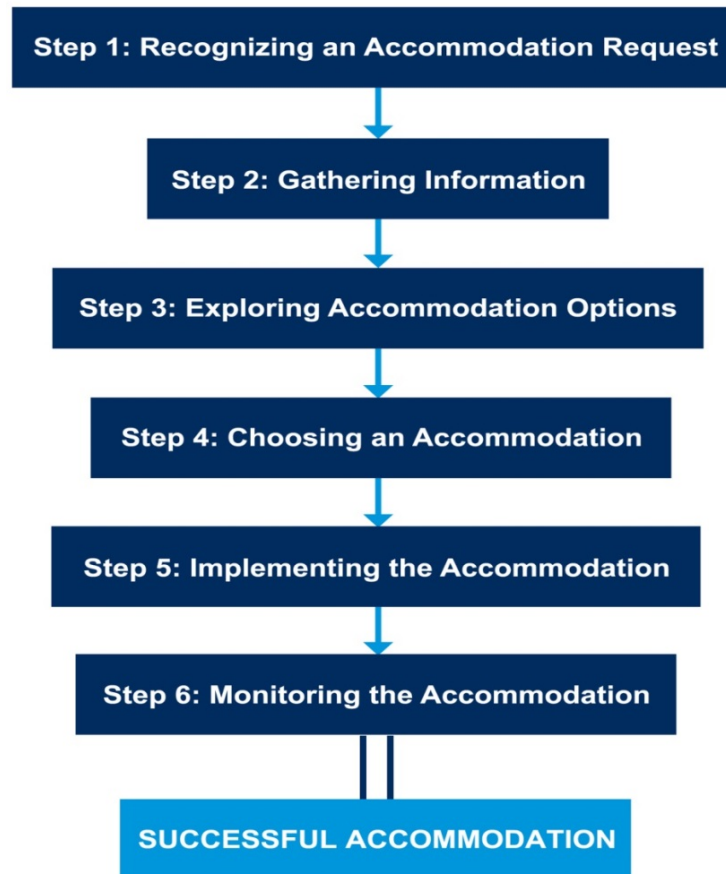
Figure 1: THE INTERACTIVE PROCESS