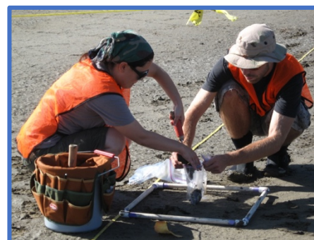
CSU Long Beach students (C. Whitcraft)

State agency contact: Justine Kimball, Ocean Protection Council, justine.kimball@resources.ca.gov , 916-653-0539