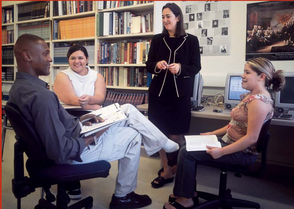
Design and Photography by University Publications, 2002