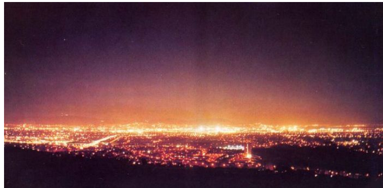
Photo of sky glow over Belfast.

Light pollution or sky glow is caused by light aimed directly up into the sky and by light reflected off the ground or objects. Sky glow prevents the general public and astronomers from seeing the stars.