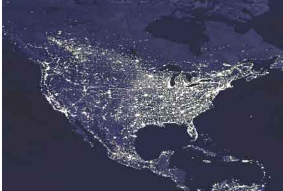
Satellite image of light reflected into space.

To minimize light pollution, use fully shielded luminaires or IESNA full cutoff type luminaires for area and roadway lighting. Full cutoff luminaires are designed with a shield to direct all light downward from the luminaire. The California Energy Code requires all luminaires over 175W to meet cutoff requirements. However, to achieve minimal light pollution, design guidelines and specifications should stipulate all luminaires as full cutoff type, regardless of wattage.